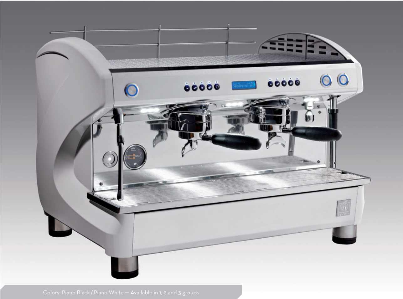
Colors: Piano Black / Piano White — Available in 1, 2 and 3 groups

High-quality design and technology have merged with essential features on LIFE & LIFE HIGH CUP. Extraction temperatures are of an absolute stability and groups are separately adjustable with the patented system Aroma Perfect. The ranges define the limits for a perfect extraction (whatever the user, environment and volume).