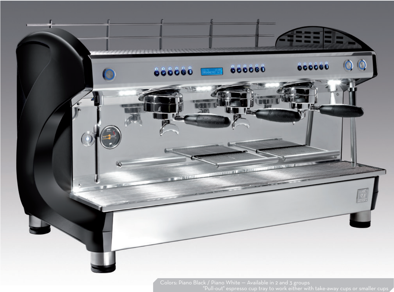
Colors: Piano Black / Piano White — Available in 2 and 3 groups "Pull-out" espresso cup tray to work either with take-away cups or smaller cups